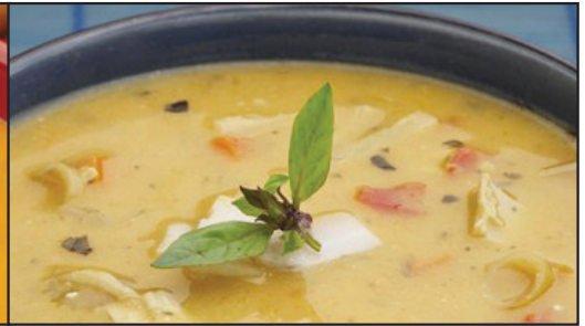
91774-0 (4/4 lb.) Northwest Style Clam Chowder