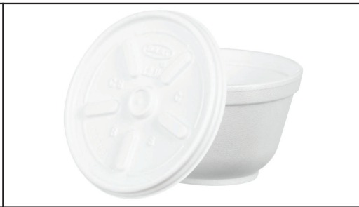
776778-3 (10/100 ct.) Hanikup 8 oz. Vented Foam Bowl Lid