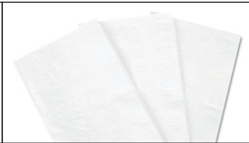
776164-6 (30/100 ct.) Companions 2 Ply White Dinner Napkin