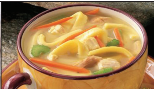
91977-9 (4/42 oz.) Heartland Chicken Noodle Soup