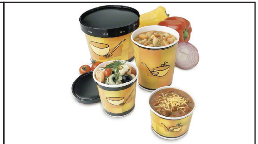
775804-8 (1000 ct.) Companions 12 oz. Hot Streetside Container