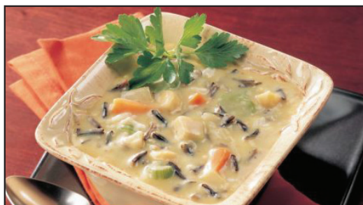
91975-3 (4/52 oz.) Chicken with White and Wild Rice Soup