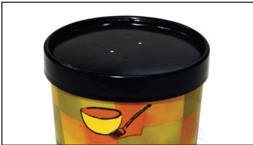
775810 (40/25 ct.) Companions 12 oz. Hot Streetside Black Container Lid