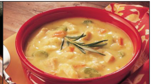
91936-5 (4/54 oz.) Creamy Chicken and Dumpling Soup