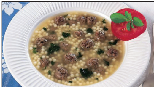
91241-0 (4/46 oz.) Italian Style Wedding Soup