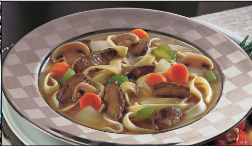
91916-7 (4/42 oz.) Beef Steak & Noodles with Mushroom