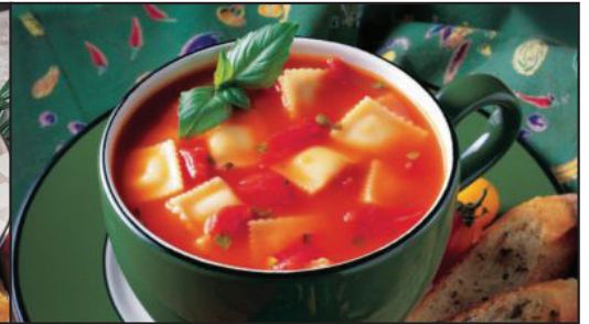
91930-8 (4/56 oz.) Tomato Basil Raviolini