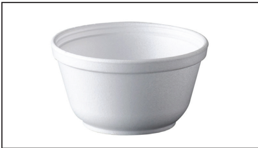
776774-2 (20/50 ct.) Handikup 8 oz. Foam Bowl