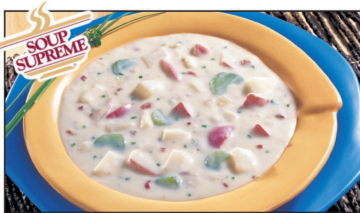
91440-8 (4/64 oz.) Baked Potato Chowder with Bacon

Keep your customers warm with amazing soups that are sure to satisfy. Add meats or vegetables to customize these ready-to-use products. Soup is great for lunches and dinners...have some prepared in to-go containers for no-hassle meals.