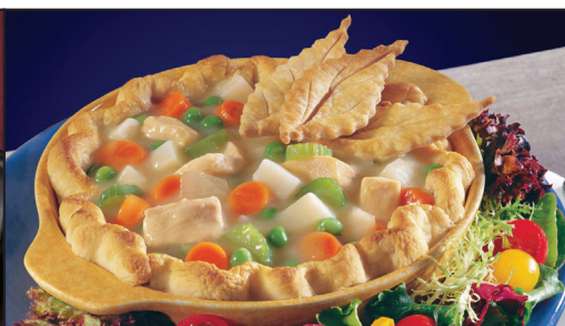
91933-2 (4/48 oz.) Hearty Chicken Pot Pie Filling