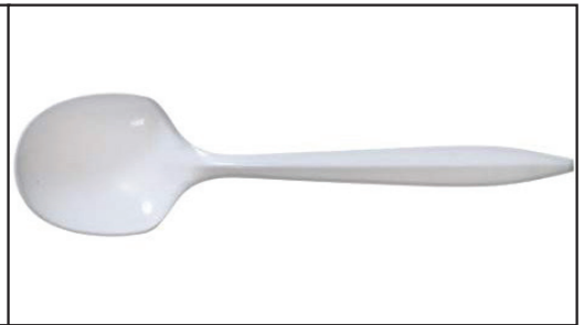
776486-3 (1000 ct.) Solo White Medium Weight Soup Spoon